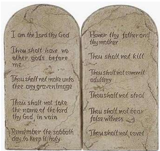
“...hence, love is the fulfillment of the Law.”